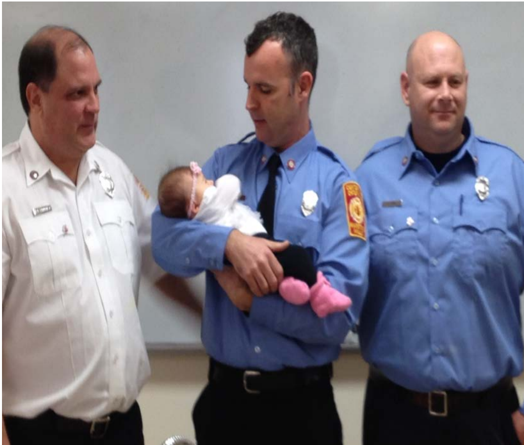
“Stork Pin Ceremony”