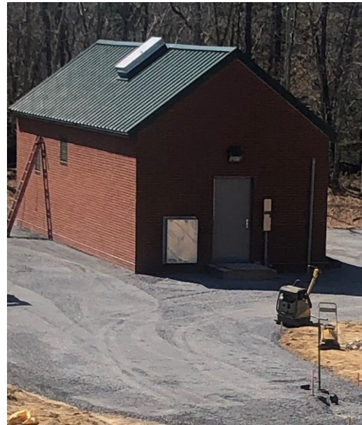
New Pump Station